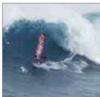
Eyal Sheref (ISR) PWA Windsurfer