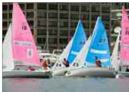
Clay Bischoff, Skipper Silver Panda Team Racing US Team Racing champions